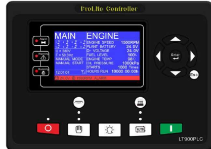
Upgraded ProLite Controller

As part of the Pit Master continuous improvement program, the current model Sunight electronic controller will now be replaced by a new upgraded version that gives increased user options while extending the durability of the unit. This change is effective as of the 01/06/2017 and any newly manufactured lighting towers after this date, will be fitted with the new improved electronic controller. Full support will be given to existing users of the current units when replacing via Technical Bulletins, or by emailing info@pitmaster.com.au , or by simply calling technical support on 1300 SX MINING or +61 7 4842 9800.